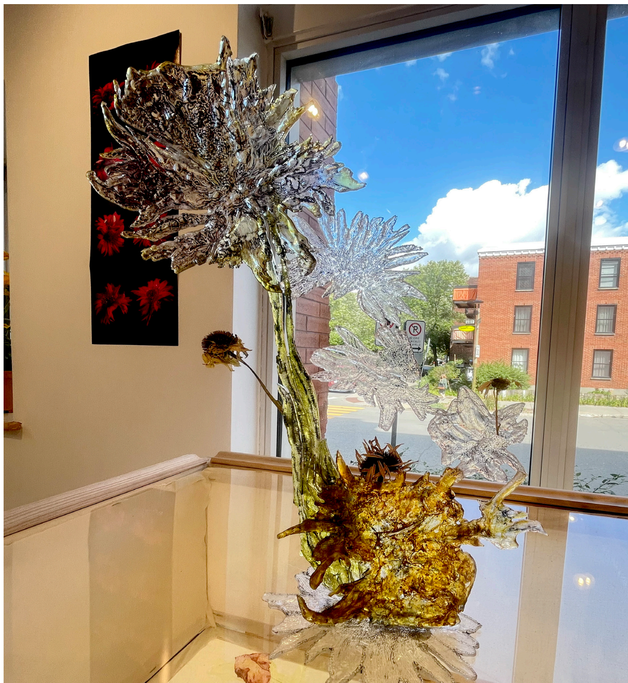
Untitled Floral Sculpture, 2025

Medium: Multi-media (glass, resin, acrylic, and real fasciated flowers)