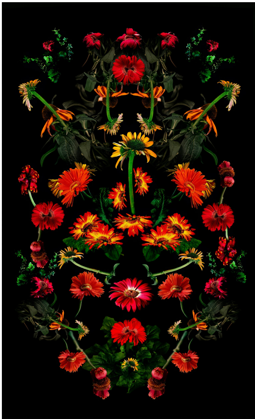
Fasciated Print #3, 2025

Large-format digital prints on fine art paper, depicting fasciated flowers collected by the artist, each 49" × 84"