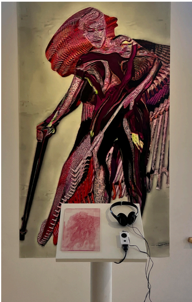
Still Life, 2025

4 giclée canvas prints (36" × 64" each), with tactile hand-engraved acrylic panels and an accompanying audio interview with the disabled performer