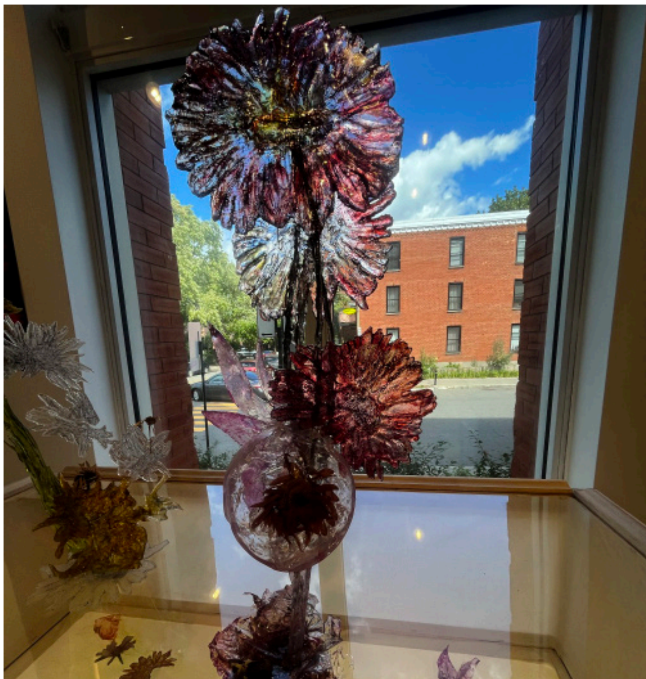
Untitled Floral Sculpture, 2025

Medium: Multi-media (glass, resin, acrylic, and real fasciated flowers)